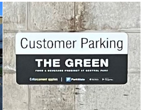
Carpark signs to look for