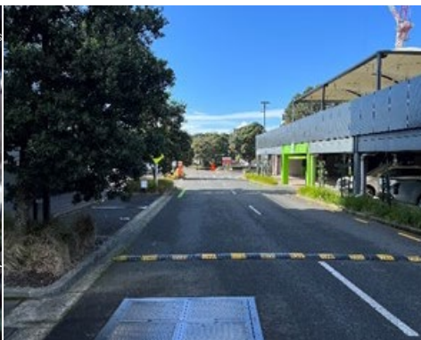
Undercover carpark entrance