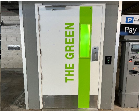
Internal door and pay station