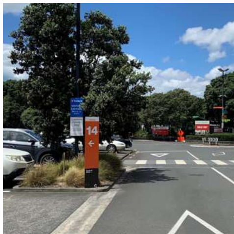
Entrance sign for our carpark

Come up to level 2, turn right out of the lifts and you can see our room with Margin Gains | Thorne Accounting sign on our door.