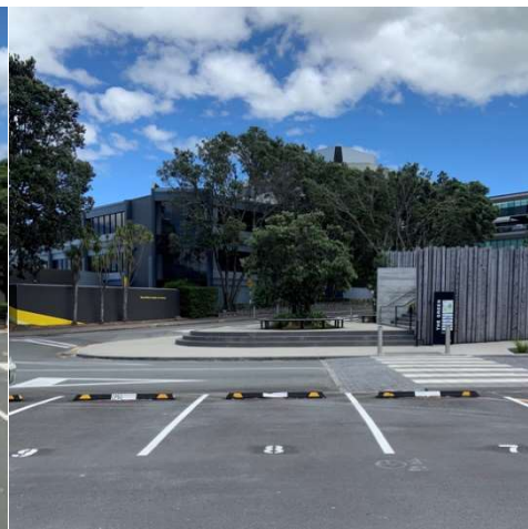
Our Carparks 7, 8 & 9