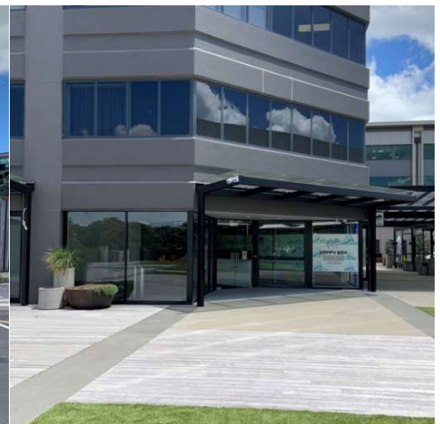
Entrance to our building

If you get stuck or lost please contact us on 0800 846 763